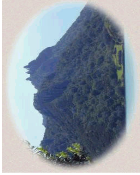
Ko Manaia te maunga

We WELCOME visitors to our Marae and ask that you look after it and enjoy your time here.